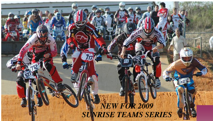
NEW FOR 2009 SUNRISE TEAMS SERIES